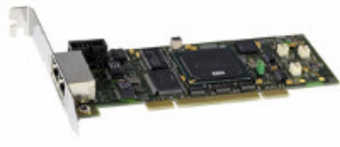
Caption: mGuard PCI in plug-in PCI card form factor for use in industrial PCs and PC-based control systems, planned to be integrated as standard remote services equipment in KBA's offset sheet printing machines.

During the pilot phase, in order to gather experience with the Internet-based remote maintenance system, Koenig & Bauer equipped more than 20 printing plants worldwide with the comprehensive mGuard solution. Among other things, a procedural form was developed for specifying the customer's IT environment and any special requirements. On this basis, configuration, functional check, and acceptance test of the appliances could already be completed ex works at KBA. In an ideal-case, the technician on-site at the customer merely needs to connect the system with the data line and supply voltage. Due to the largely standardised configuration of the appliances, the administrative complexity is reduced to a minimum.