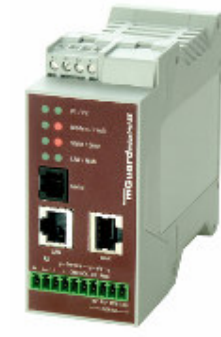
Caption: mGuard industrial RS, Innominate's new remote services appliance for DIN rail mounting. In addition to the standard Ethernet interface, the device features optional integration of analog or ISDN modems. For machines and production plants, these options enable the simple migration from traditional modem-based remote maintenance to modern remote services applications via the Internet.